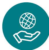
Human rights violations