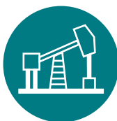
Oil or tar sands