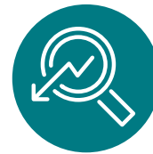
Poor corporate governance