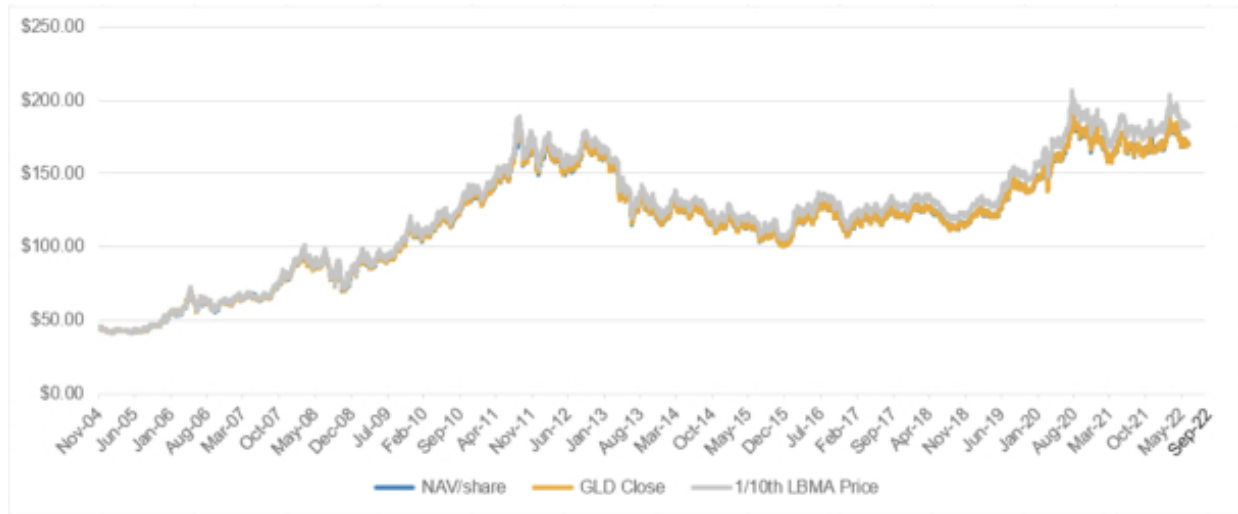
Share price & NAV v. gold price – November 18, 2004 to September 30, 2022

The divergence of the price of the Shares and NAV of the Shares from the gold price over time reflects the cumulative effect of the Trust expenses that arise if an investment had been held since inception.