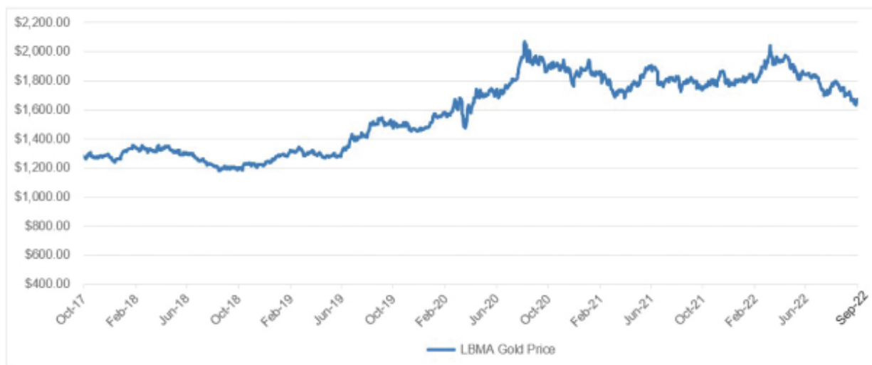
Daily Gold Price – October 1, 2017 – September 30, 2022 LBMA Gold Price PM USD

The following chart provides historical background on the price of gold. The chart illustrates movements in the price of gold in U.S. dollars per ounce over the period from October 1, 2017 to September 30, 2022 and is based on the LBMA Gold Price PM.