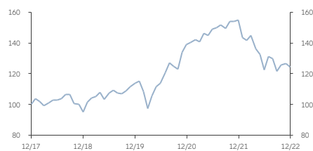
■ Class AT (USD) Acc.