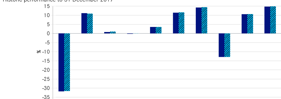
Historic performance to 31 December 2017

† Benchmark: FTSE Global Core Infrastructure Index (USD). Prior to 22 May 2017 the Fund used a different benchmark which is reflected in the benchmark data. From 20 March 2017 to 22 May 2017, the Fund transitioned to the current index in three tranches which is reflected in the benchmark data.