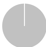
2. Taxonomy-alignment of investments excluding sovereign bonds*

■ Taxonomy-aligned: fossil gas (0%) ■ Taxonomy-aligned: nuclear (0%) ■ Taxonomy-aligned (no fossil gas & nuclear) (0%) ■ Non Taxonomy-aligned (100%)