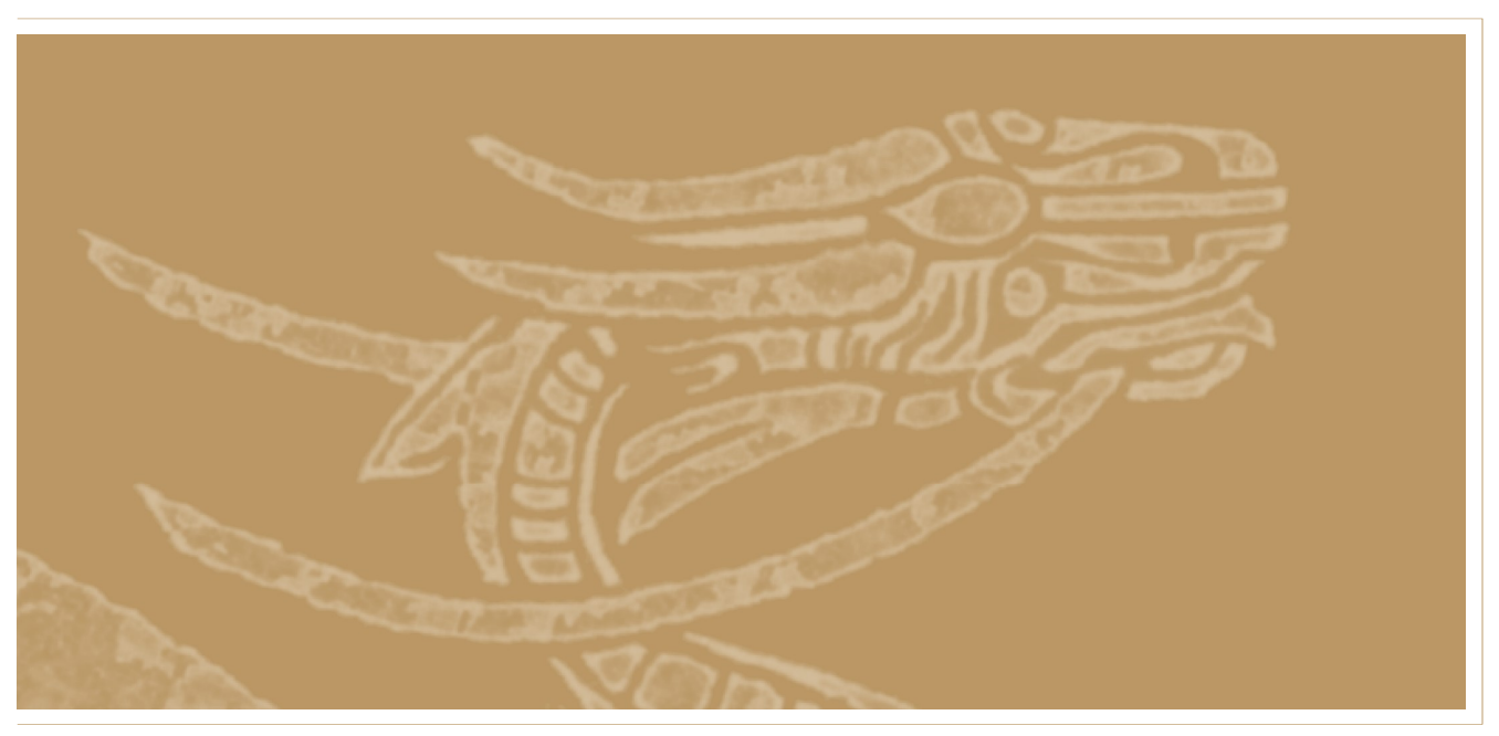
Société d'investissement à capital variable Luxembourg