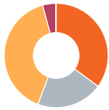
Composition as of 03-31-23