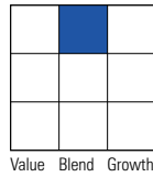
Morningstar Style Box™ as of 03-31-23(EQ) ; 03-31-23(F-I)