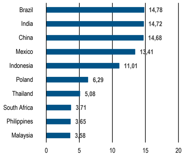
Top 10 Currency Exposure (%MV)