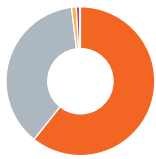
Composition as of 03-31-23