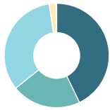
Composition as of 06-30-24