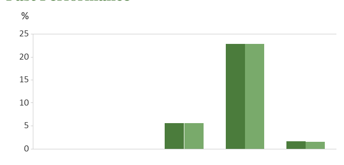
■ SPDR S&P U.S. Consumer Discretionary Select Sector UCITS ETF (Acc) ■ Index