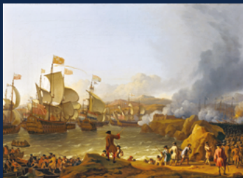
Front Cover: 'The Battle of Vigo Bay, 12 October 1702' (Ludolf Backhuysen)