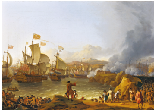
Front Cover: 'The Battle of Vigo Bay, 12 October 1702' (Ludolf Backhuysen)