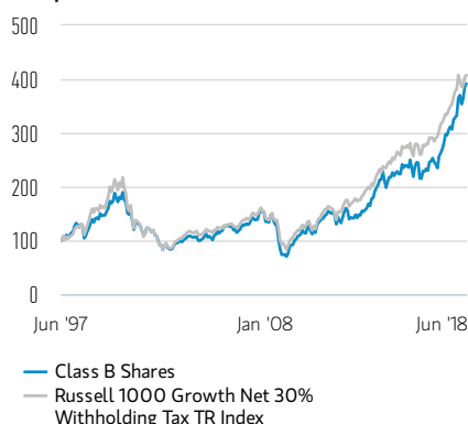
Performance of 100 USD Invested Since Inception (Cash Value)