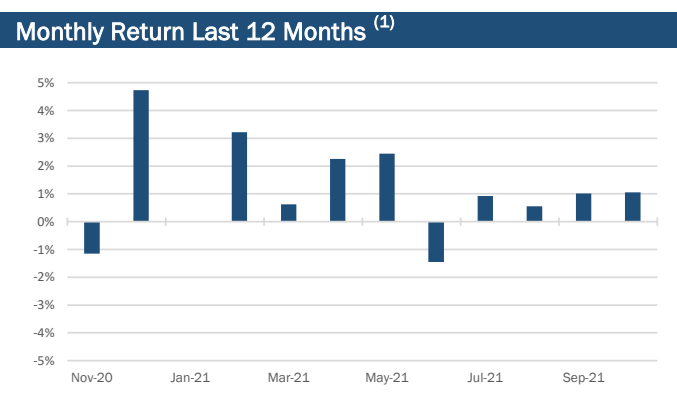
Systematic Alpha I1C-U (DBSI1CU LX )