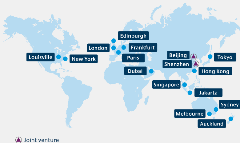
▲ Joint venture

With expertise across a range of asset classes and specialist investment sectors, our approach to investment is driven by a commitment to provide the best possible outcomes over the long term for our investors. To achieve this, we ensure our interests are aligned with our investors and uphold a culture of consistently acting in our clients' best interests.